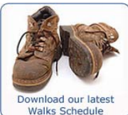
Download our latest Walks Schedule

Put your best foot forward this Autumn and join one of the Health Walks in Gloucester. For details of the latest walks programme together with further news and information click here