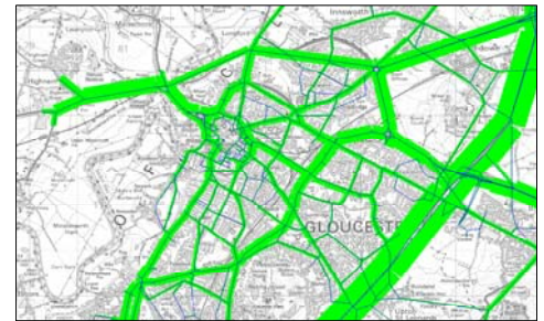
Gloucester's Major Transport Routes

At the last Westgate PAG meeting discussion centred on the draft Gloucester Transport Strategy. Existing infrastructure or policy interventions by County Highways will not on their own address all the issues facing Gloucester. As well as visionary solutions to address highways targets, there are concerns about balancing transport needs with the environment and the economy (shops tend to want access for car drivers, for example), and also the need to respect the overall "feel" of Gloucester as a place people will want to visit.